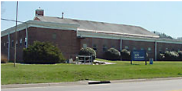
Scarboro Building, 1299 Bethel Valley Road