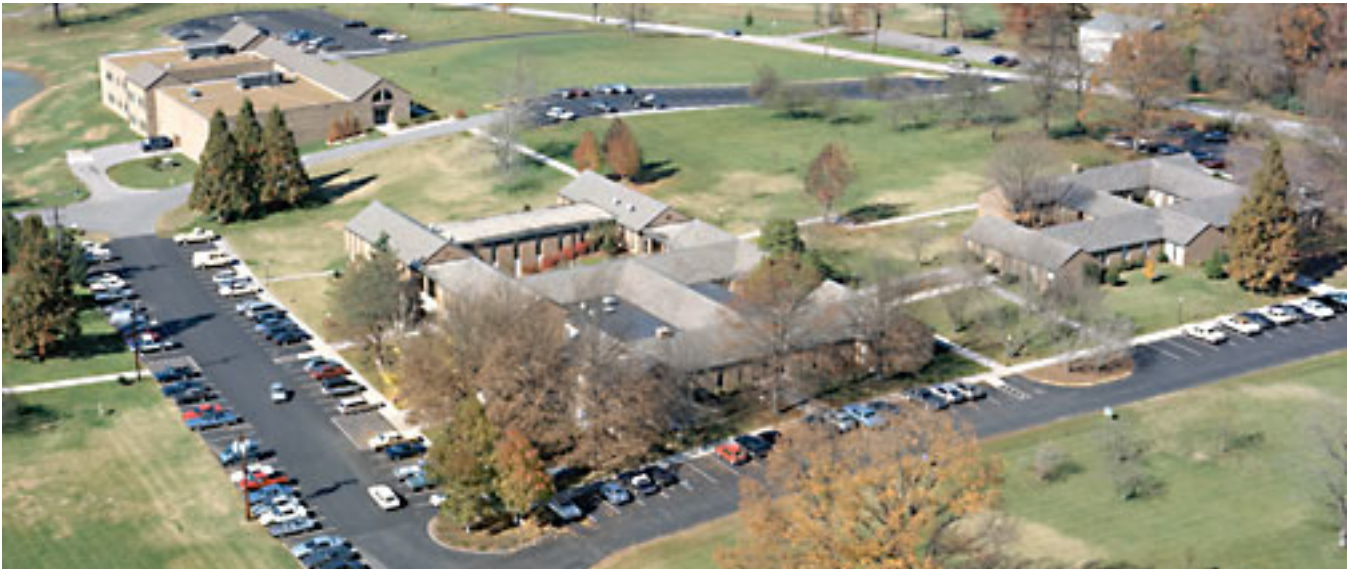
ORAU “Main Campus”- Central Administration Building (CAB), 130 Badger Avenue; Energy Building, 120 Badger Avenue; William G. Pollard Auditorium, 210 Badger Avenue