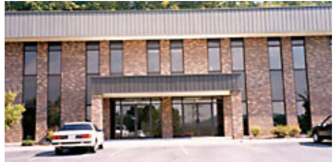
Pine Ridge Office Park, 702 S. Illinois Avenue