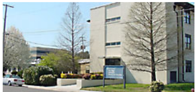
Vance Road, 140 E. Vance Road