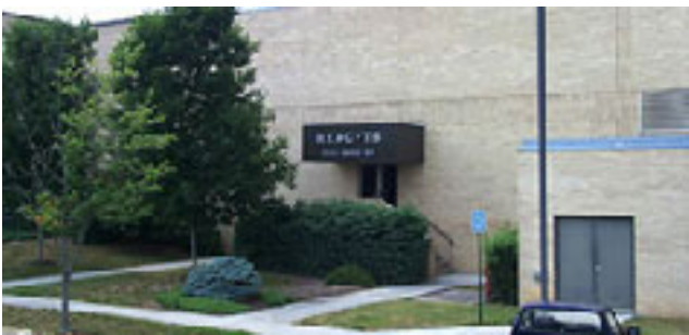
Radiation Emergency Assistance Center/ Training Site (REAC/TS), 150 E. Vance Road