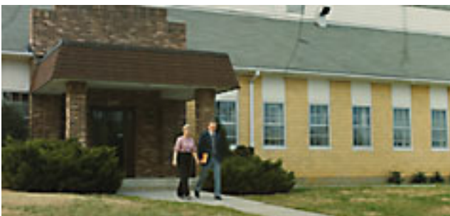
Lab Road, 246 Laboratory Road