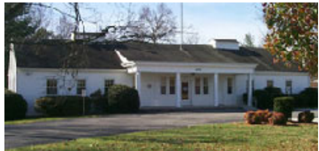
Atmospheric Turbulence and Diffusion Division (ATDD), 456 S. Illinois Avenue