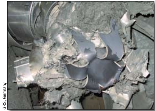
BWR piping at the Brunbuettel NPP in Germany after a hydrogen explosion.

The ICDE Project comprises complete, partial and incipient common-cause failure events. The project currently covers the key components of the main safety