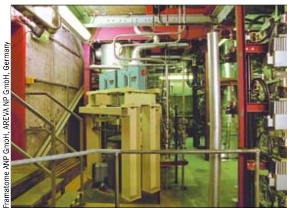
PKL test facility in Erlangen, Germany.

Three tests were carried out in 2006. Their preparation and the first test outcomes were extensively discussed at the two meetings of the project steering bodies that took place during the year. A workshop covering an analytical exercise with code predictions related to the PKL tests was also held in 2006. The project is set to continue until May 2007 to enable completion of the final report.