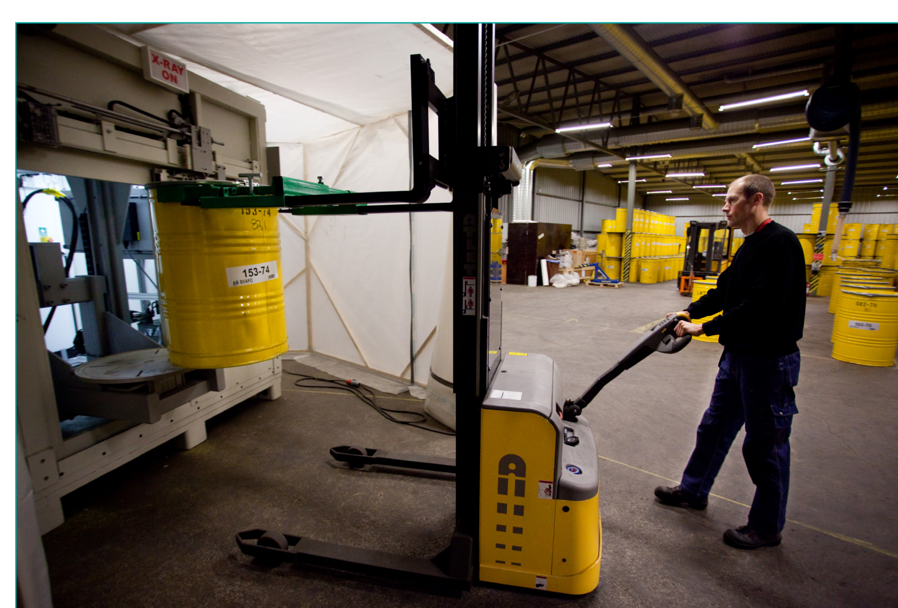
Handling of drums in the x-ray vault for real time radiosopic (RTR) examination.