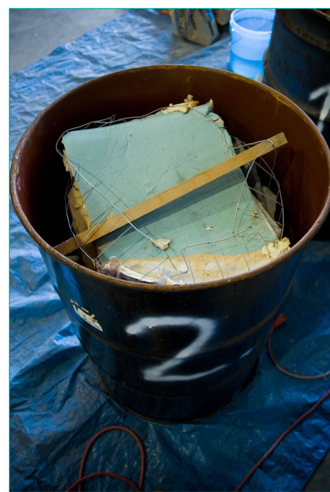
One of five test drums that were manufactured in the US to evaluate the x-ray method.